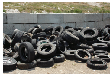
Waste tires picked up from Lompoc residents on Tire Roundup Day.

Did you know Californians discard an estimated 40 million waste tires each year? In an effort to promote waste tire recycling, and reduce the amount of illegal dumping, the City is conducting a Waste Tire Roundup Day. On Waste Tire Roundup Day, City of Lompoc residents can have their old tires picked up from their curb or alley free of charge . Call (805)875-8024 to make an appointment, and place your tires out for collection by 7:00 a.m., Wednesday, February 8th.